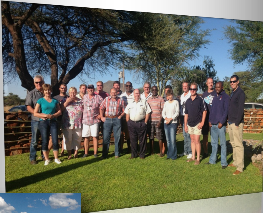
Leadership Programme 9-11 May 2014