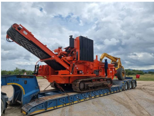
Above picture: Nexus Biomass new toy to kick start the biomass project.

Below is are pictures of the work- in progress of the Ovitoto Road